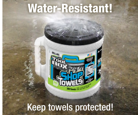
Compare to SCOTT** Shop Towels