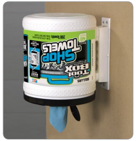
Big Grip® Bucket hanging on bracket

**SCOTT is a registered trademark of Kimberly-Clark Worldwide Inc.